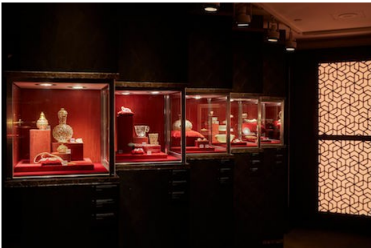
Christie's Maharajas & Mughal Magnificence auction objects will be on public display June 14-18 at 20 Rockefeller Plaza, New York, NY 10020, with the auction scheduled for June 19, 2019.

Video: Overview of Christie's Maharajas & Mughal Magnificence auction