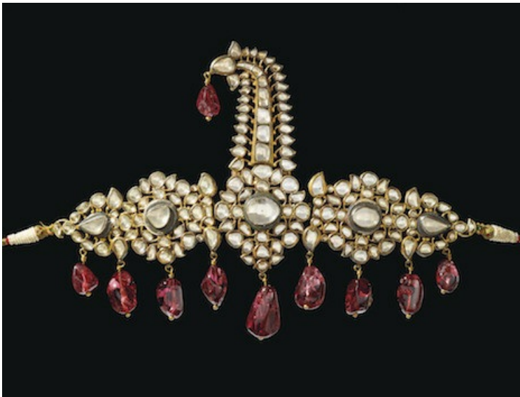
Lot 311: The Nizams of Hyderabad "Sarpech" Diamond and Spinel Turban Ornament at Christie's Maharajas & Mughal Magnificence exhibition.

The gems comprise diamonds, emeralds, rubies and sapphires along with pearls and jade, all encased in platinum, gold or silver.