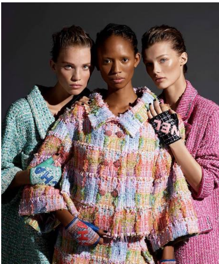
There is a call for more feminine styles of leadership.