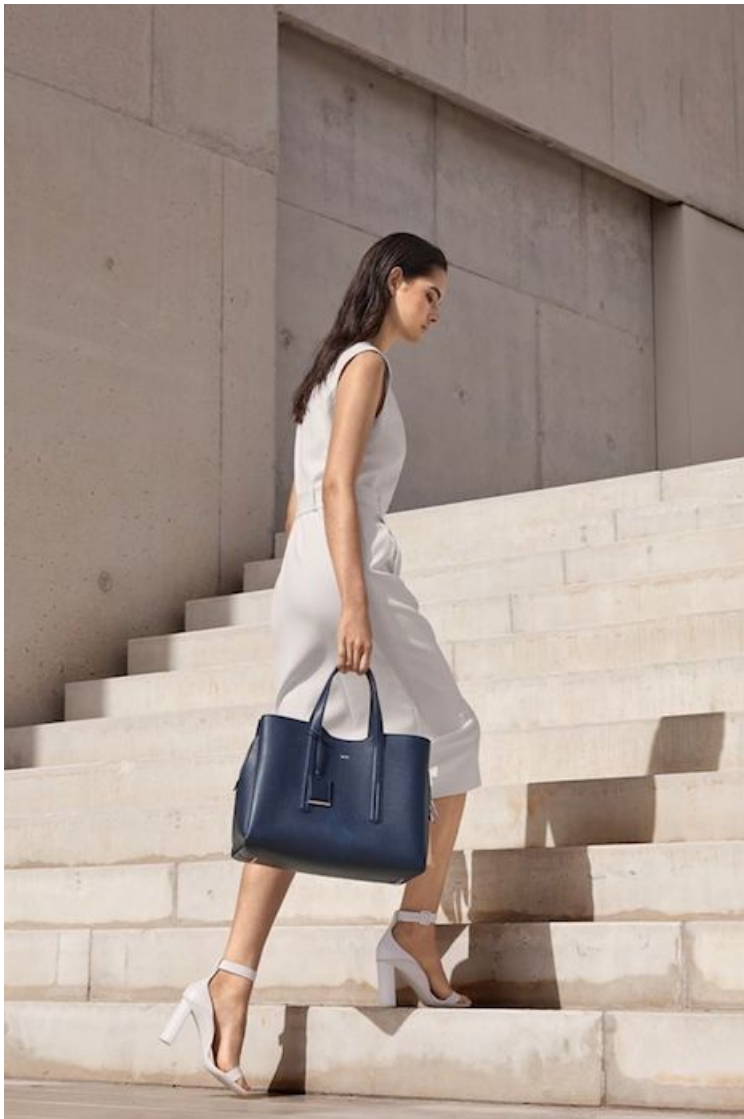
Women are climbing the corporate ladder.

BCG found in its research that women show similar signs of ambition at their respective companies, with the gap in their desire for advancement driven more by company culture than internal factors.