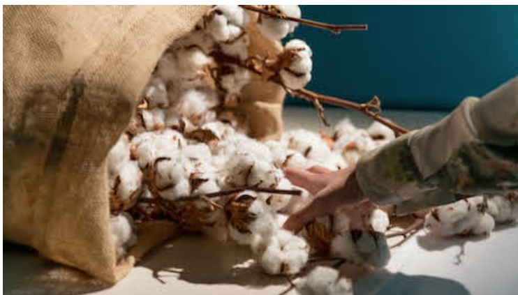
Kering sees sustainability as an opportunity for innovation and not a sacrifice.