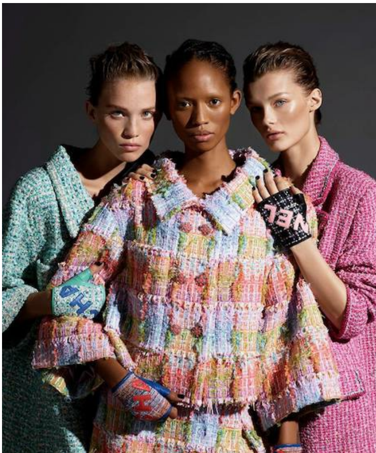
There is a call for more feminine styles of leadership.