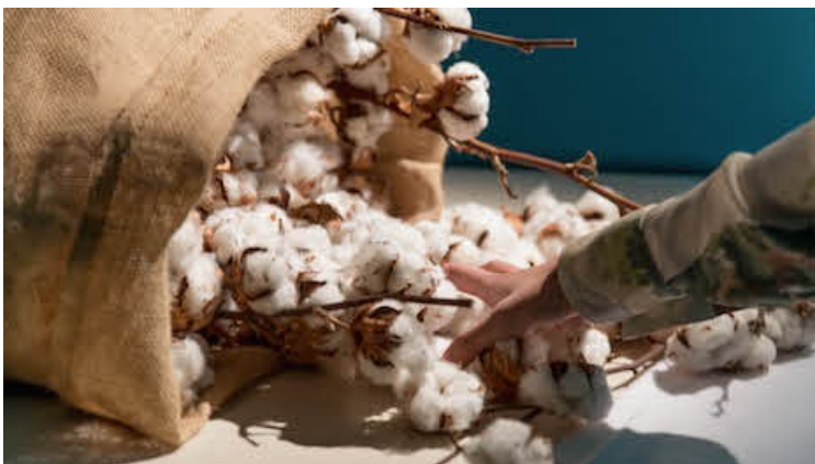
Kering sees sustainability as an opportunity for innovation and not a sacrifice.