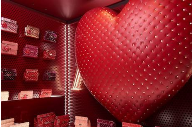
Inside Valentino's pop-up at Htel Costes.

Italian fashion label Valentino staged a temporary boutique within a Parisian hotel, coinciding with an exclusive version of Valentino's Rockstud Spike handbag in burgundy velvet. An oversized studded heart in Valentino red was one of the outpost's focal points ( see story ).