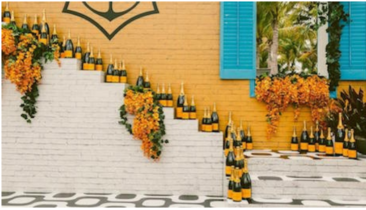
Veuve Clicquot stands out with its use of marigold.

Over the years, the shade of yellow took on an almost orange hue, which helped cellar masters find bottles of Veuve Clicquot in dark wine cellars. Although the reason for yellow is unknown, the visual innovation was ahead of its time ( see story ).