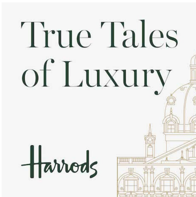
Harrods: True Tales of Luxury podcast.

British department store chain Selfridges similarly embraced the intersection of art and fashion with a creative campaign that incorporated podcasting. The "State of The Arts" initiative is influencing everything from Selfridges' window displays and product offerings to a podcast series ( see story ).