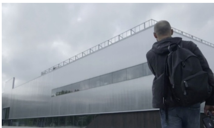
An image from Prada Journal.

Prada Journal asks fans to send in their own images, whether they are photographs or illustrations, along with text that tells a story. Earlier years of Prada Journal took a more literary bent, while 2016 saw the brand moving toward multimedia ( see story ).