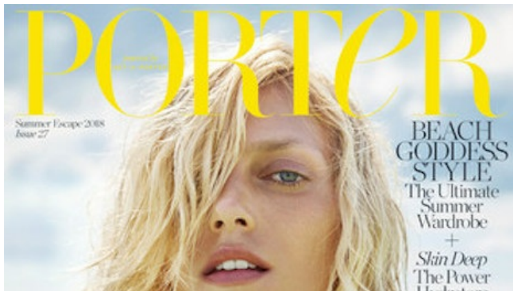
Cover of Net-A-Porter's magazine.