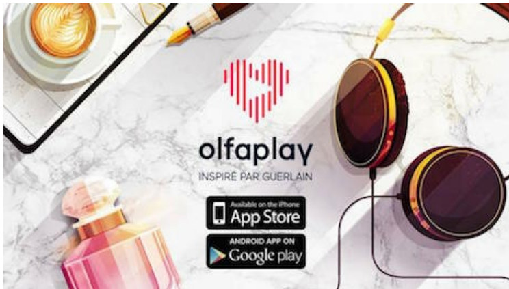
Olfaplay, Geurlain's new platform.

Guerlain is engulfing fragrance fans into its world with a variety of stories centered on perfume. The perfumer has created a new digital platform, dubbed Olfaplay, that invites a variety of speakers to share their stories in relation to scent, looking to make an audio impression in a time where social media has created shorter attention spans ( see story ).