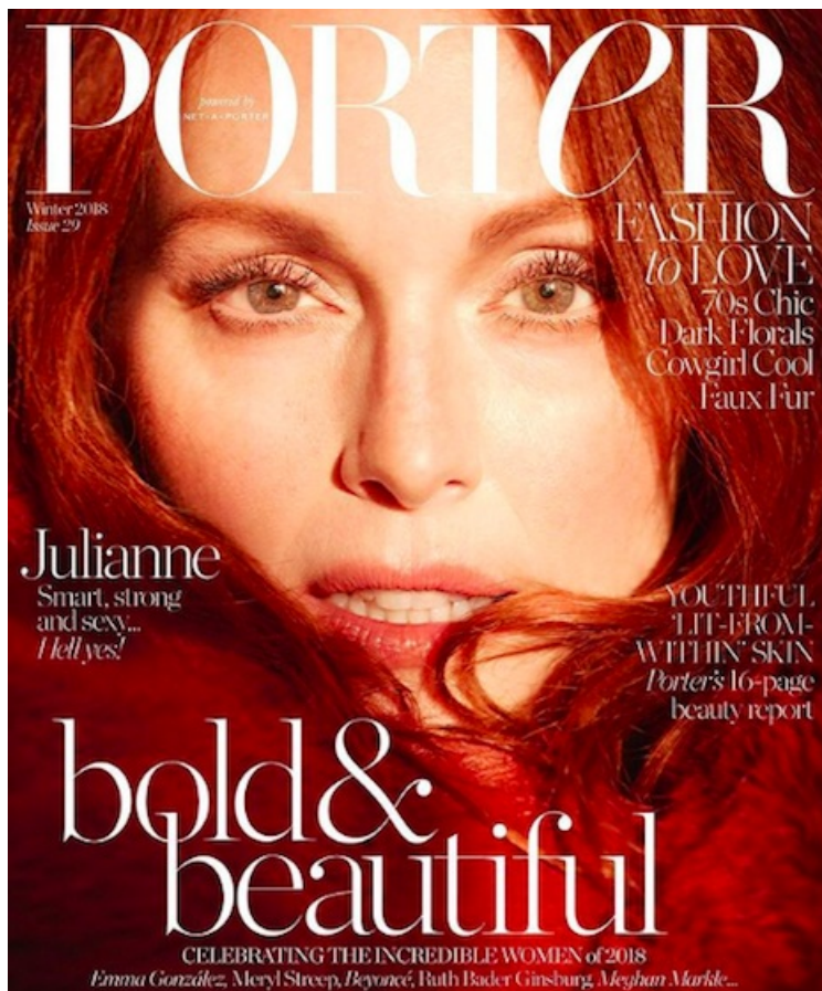
Porter's Winter 2018 issues.

Porter launched in 2014 ( see story ) and spans both print and digital. But through the use of digital, Net-A-Porter has learned to simultaneously usher in sales with the editorial endeavor.