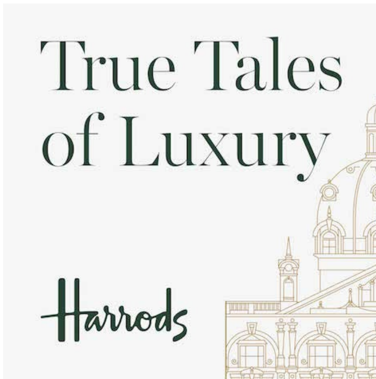
Harrods: True Tales of Luxury podcast.

British department store chain Selfridges similarly embraced the intersection of art and fashion with a creative campaign that incorporated podcasting. The "State of The Arts" initiative is influencing everything from Selfridges' window displays and product offerings to a podcast series ( see story ).