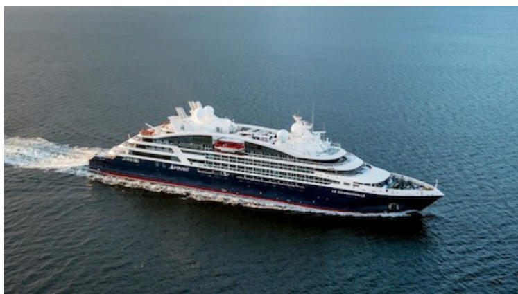
Ponant Explorer.