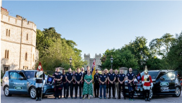
Land Rover is supporting charities that help rehab injured soldiers.