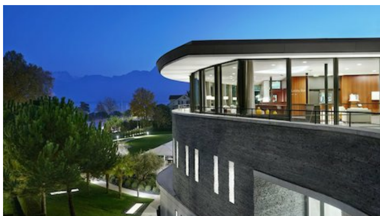
The spa building at Clinique La Prairie in Verbier, Switzerland.