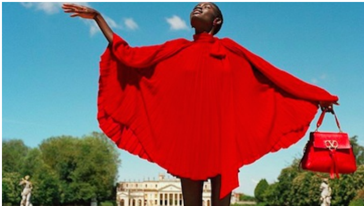
Valentino highlights red for its pre-fall collection.