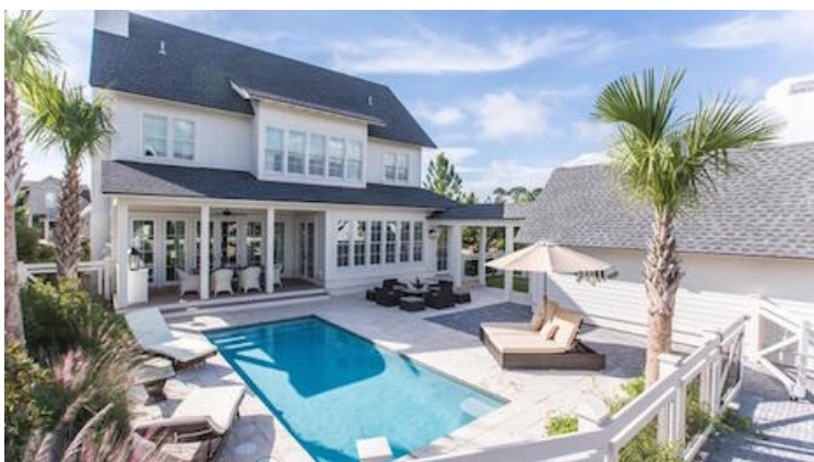
Home rentals are becoming extremely popular.

Marriott International has even competed directly on Airbnb's turf by investing in a home rental business ( see story ).