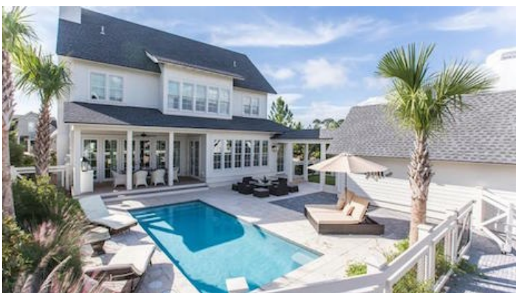
Home rentals are becoming extremely popular.

Marriott International has even competed directly on Airbnb's turf by investing in a home rental business ( see story ).