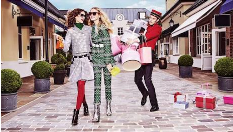
Off-price requires a balancing act for luxury brands.