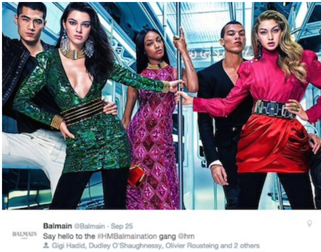
Campaign ad for Balmain's partnership with H&M

Affluent millennial consumers tend to have less affinity for the traditional markers of luxury and are happy to mix high-fashion with low-fashion. As a result, partnering with brands of different price points, while counterintuitive, can help to build long-term brand equity ( see story ).