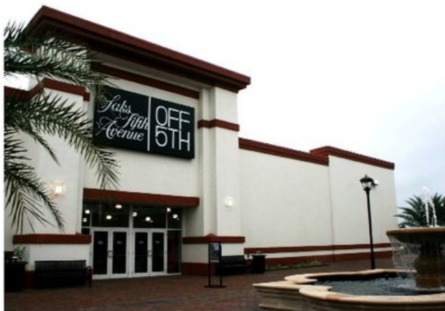
Saks Off 5th.

Additionally, outlet stores have come to be seen as a major growth engine for department stores that have suffered from a lack of foot traffic to bricks-and-mortar locations. Major players in this field such as Nordstrom, Saks Fifth Avenue and Bloomingdale's have all invested heavily in their outlet programs ( see story ).