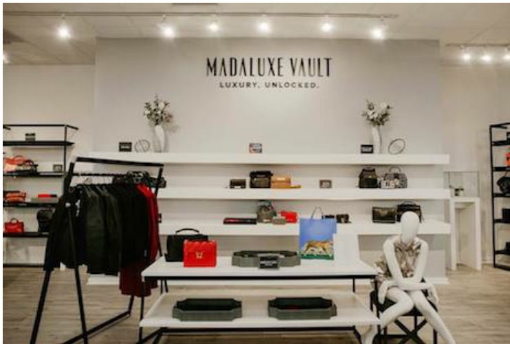
MadaLuxe Vault store in Los Angeles.

Outlet stores also help luxury brands fend off the rise of the resale market, which is projected to grow to $33 billion in value by 2021. The resale market, which is driven by millennials, the sharing economy and a broad lifestyle trend toward decluttering, has the potential to siphon significant revenue from the luxury market ( see story ).