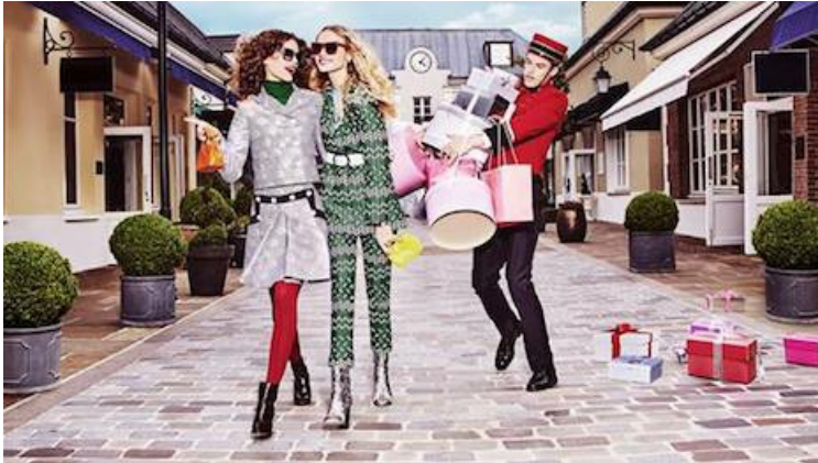
Off-price requires a balancing act for luxury brands.