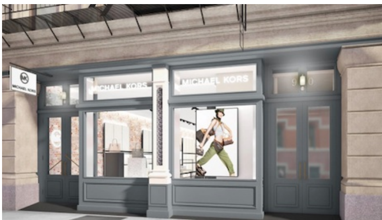
Rendering of Michael Kors' future SoHo store.

In addition to diffusion lines, brands have also increasingly turned to licensing deals, an option that holds far more risk because it gives brands less control over the final product ( see story ). For example, British fashion house Burberry has had to cancel licensing deals in the past because of poor execution ( see story ).