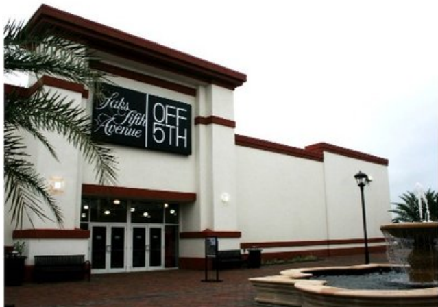
Saks Off 5th.

Additionally, outlet stores have come to be seen as a major growth engine for department stores that have suffered from a lack of foot traffic to bricks-and-mortar locations. Major players in this field such as Nordstrom, Saks Fifth Avenue and Bloomingdale's have all invested heavily in their outlet programs ( see story ).