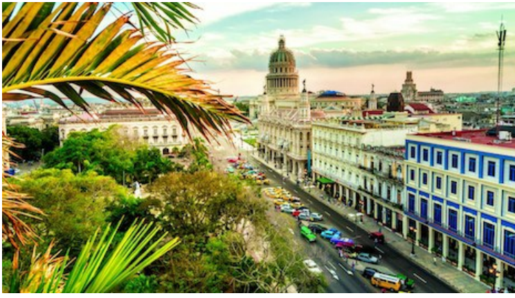
Seabourn is now traveling to Cuba.

Since the travel embargo between the United States and Cuba was lifted, the Caribbean nation has also been a hot spot for affluent vacationers.