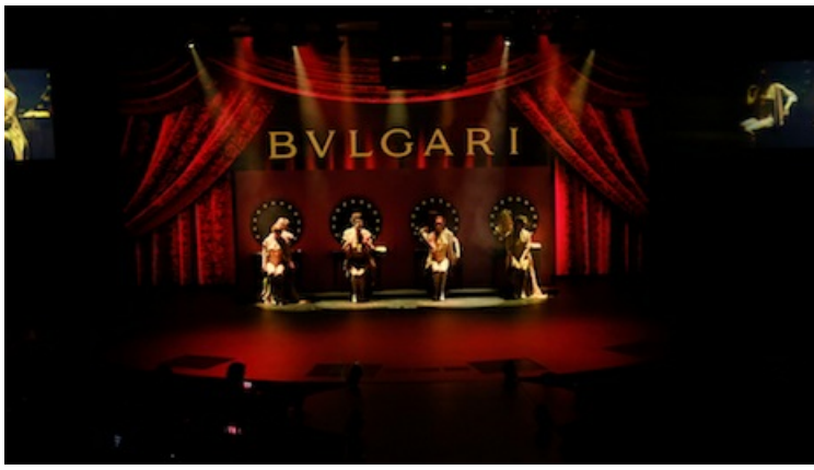
Bulgari is hosting a show on Costa Venezia.

Starboard Cruise Services and Costa Cruises has partnered with Italian jeweler Bulgari to stage an onboard experience that blends elements of entertainment, product showcase and brand education. The Bulgari Jewelry Fashion Show will be held once per itinerary on the newly launched Costa Venezia vessel.