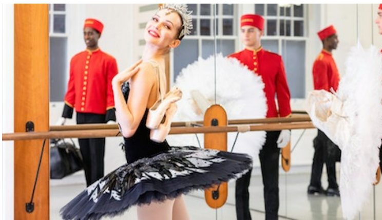
Cunard announced partnership with English National Ballet.

In a partnership with the English National Ballet, Cunard is providing guests with a rare opportunity to not only see a special performance but also a behind-the-scenes look at rehearsals and meet the dancers during a one-time-only trip ( see story ).