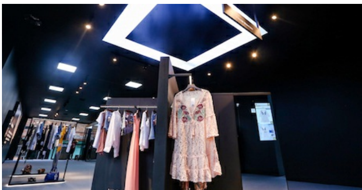
Alibaba has opened up an artificial intelligence-enabled concept store.

One way the city can maintain its status is by encouraging businesses to incorporate artificial intelligence and other recent technological breakthroughs into stores and throughout everyday life. For example, the city can champion the use of blockchain to improve security and transparency throughout the business community ( see story ).