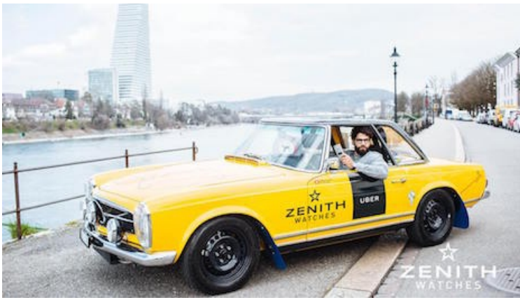
Zenith-branded classic car, provided by Uber for Baselworld

Google, Uber, Facebook and AirBnB are all headquartered in or around San Francisco, and new tech companies are receiving major seed investments all the time.