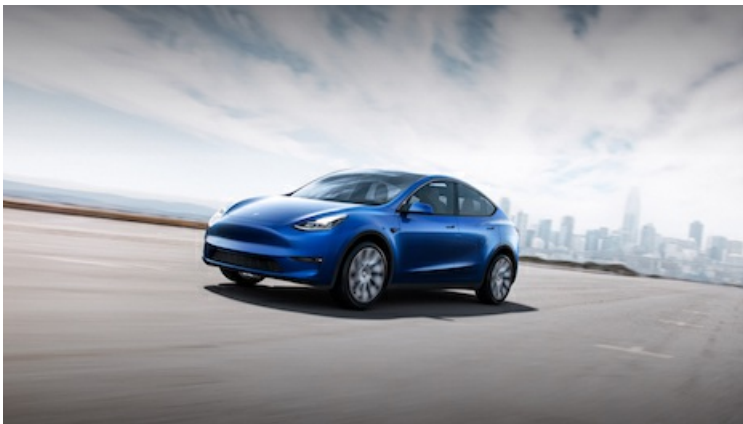
Tesla's Model Y.

In the immediate aftermath of this wealth creation, wealth managers expect to see a rise in extravagant parties and conspicuous consumption . Luxury brands in particular will likely see a rise in major purchases from furnishings for new homes to high-end automobiles for new garages.