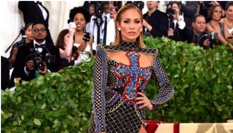
Balmain's designs were created specifically for the Met Gala.

Fashion and beauty brands, on the other hand, generally have to tap elite influencers to make a splash on the platform. Brands including Balmain and Moschino have been able to leverage the cultural capital of their head designers for Instagram pages that look like highlight reels from celebrity after parties.