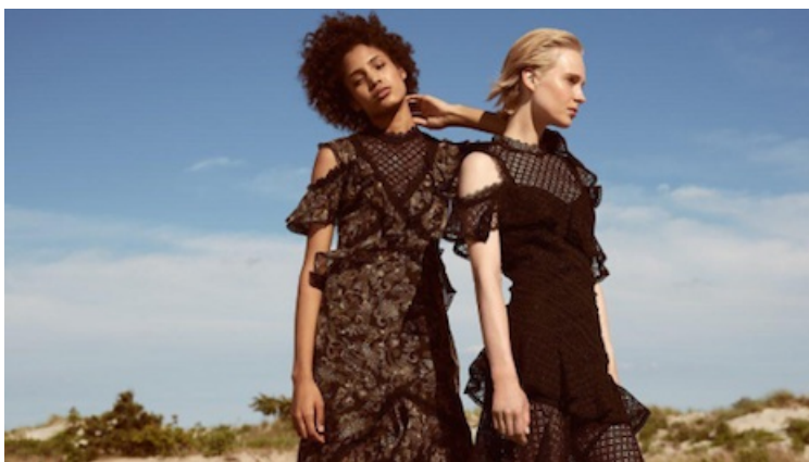
Rent the Runway and other disruptors are changing the fashion game.

"Therefore, marketers need to create seamless a consumer journey that permits them to buy tickets, attend the show and share the experience across social channels," she said. "They should find ways of how more value can be added to consumers' experience."