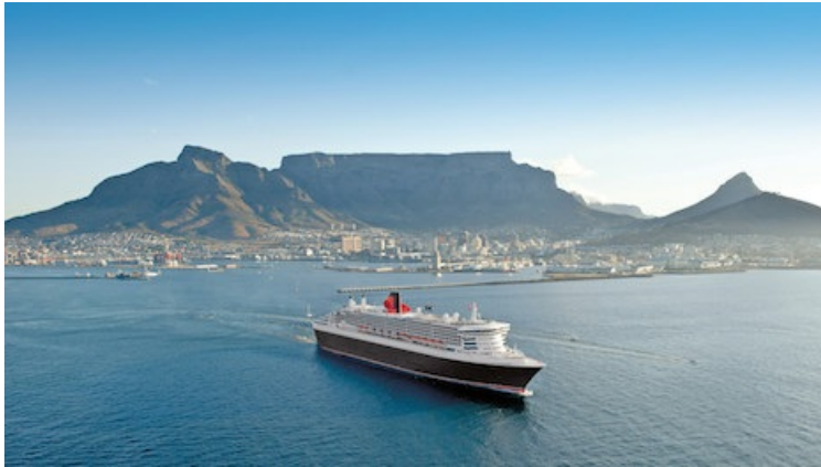
Cunard introduces customized voyage and tour packages.

Each year, luxury travel companies unveil new packages that let consumers access seemingly unprecedented experiences, such as a hotel room submerged in water or tours given by rare experts in a field .