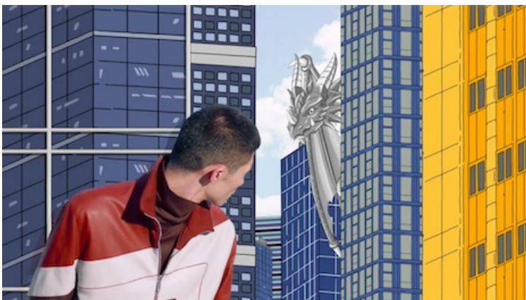
Hermès: China still packs power.