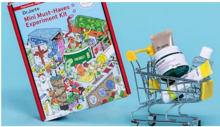
Dr.Jart+ was recently scooped up by Estee Lauder.

In retail, Farfetch acquired New Guards Group and closed its acquisition of Stadium Goods.