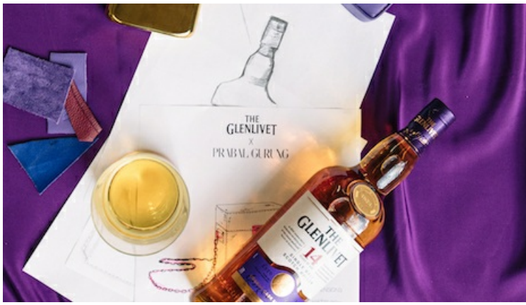
The Glenlivet is collaborating with Prabal Gurung.

Companies also collaborated with celebrities and influencers to gain attention. For instance, Balmain tapped Kylie Jenner for a runway show beauty partnership, while Lancme launched a makeup collection designed by Chiara Ferragni.