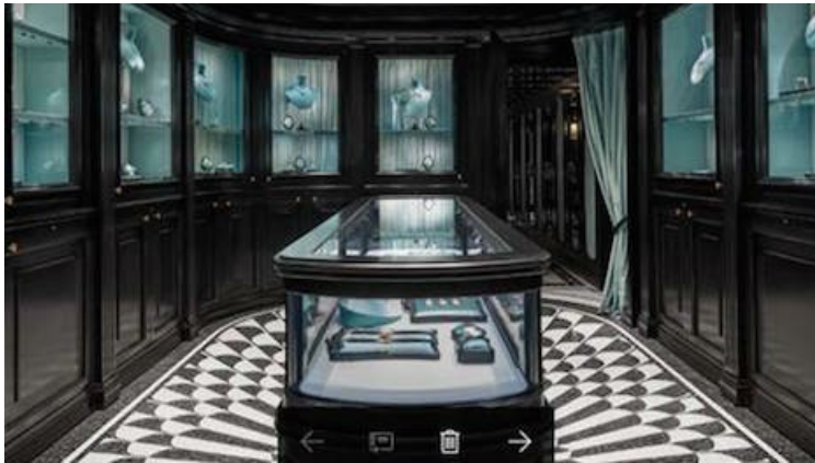
Gucci unveils its high jewelry collection, sold in its Place Vendôme boutique.

Some exclusive approaches this past year included the launch of Celine's fragrance line that is only available in the brand's boutiques ( see story ). Similarly, Gucci's high-jewelry line is solely sold in a single store in Paris ( see story ).