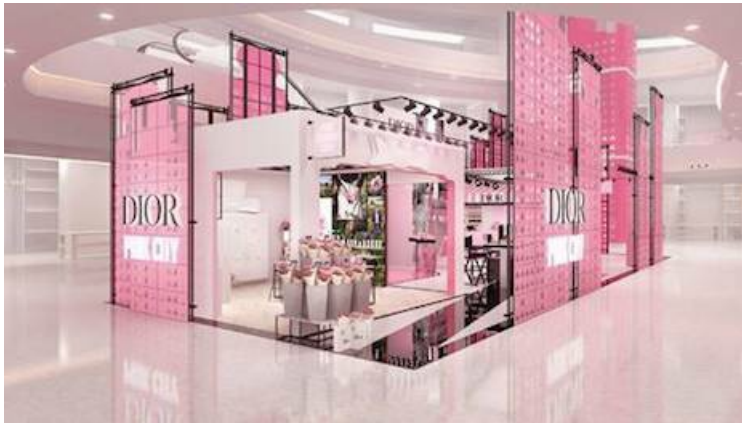
Dior's Pink City pop-up in Macau.

The temporary Pink City outpost was designed as a branded microcosm, complete with a library, music hall, caf and flower shop. This first of its kind pop-up is intended to provide a form of retailtainment to shoppers through interactivity ( see story ).