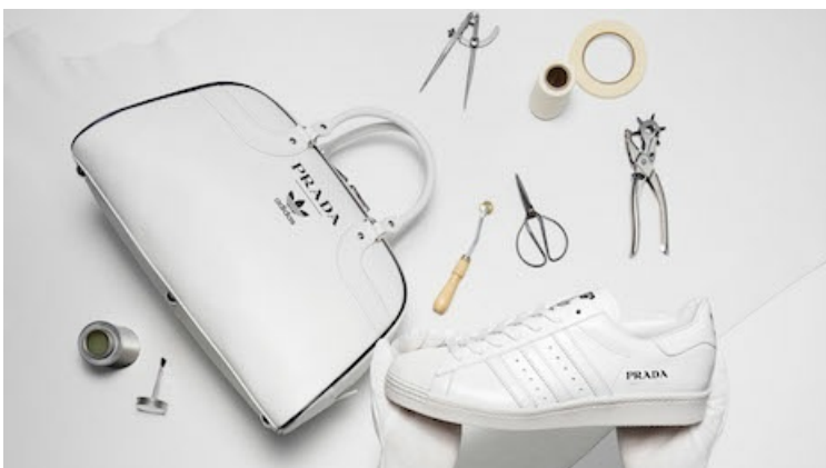
Prada has collaborated with Adidas on two limited-edition accessories.

In November and December, Missoni, Balmain and Prada all rolled out partnerships that bridge athleisure and performance activewear. According to NPD Group, athleisure currently represents about 24 percent of the total U.S. fashion market, and this share is projected to grow through this year ( see story ).