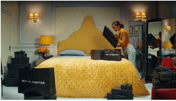
Luxury shoppers are leaning into ecommerce.

According to a report from Dotcom Distribution, luxury consumers' expectations are higher when it comes to packaging, and they are more willing to spend on services such as expedited shipping. For luxury brands, it has become even more imperative to invest in ecommerce, as a growing percentage of purchases move online.