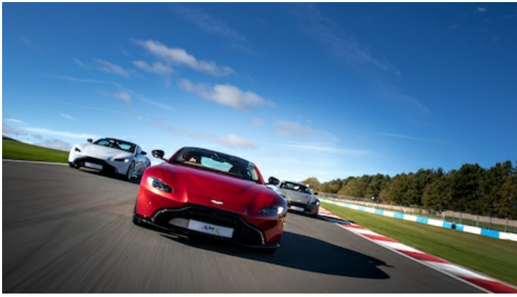
Aston Martin's new AMR experience will provide training on driving its vehicles on a racetrack.

From pop-ups to exclusive test drives, more automakers are taking luxury experiences to a new level. While some are geared towards current owners, other experiences are meant to make high-end vehicles more accessible ( see story ).