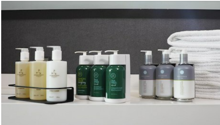
Marriott is getting rid of single-use plastic toiletry bottles.

In hospitality, hotel groups did away with individual toiletry bottles, continuing the trend that began with plastic straw bans in 2018. Another area that Marriott is targeting is food waste.