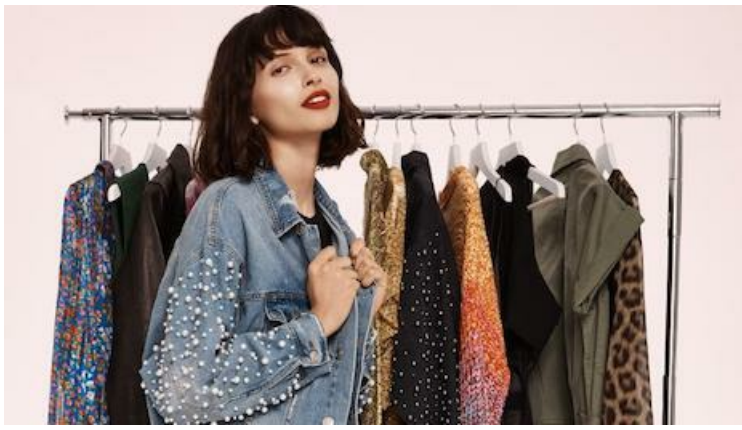
Bloomingdale's recently launched its own subscription service.

The high-end pre-owned market may help, rather than harm, the overall luxury industry more than initially expected, according to new research from Boston Consulting Group and secondhand luxury platform Vestiaire Collective.