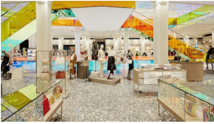
Saks Fifth Avenue's innovative flagship store design.