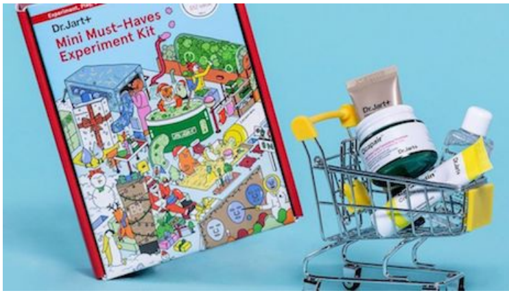
Dr.Jart+ was recently scooped up by Estee Lauder.

In retail, Farfetch acquired New Guards Group and closed its acquisition of Stadium Goods.