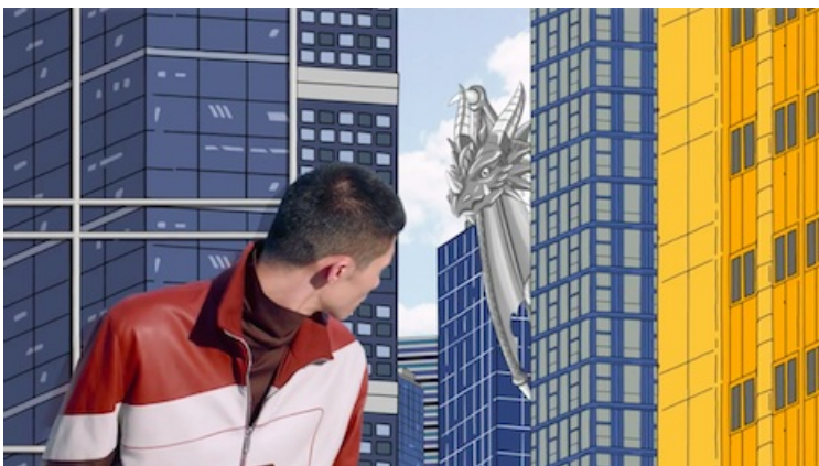
Hermes: China still packs power.