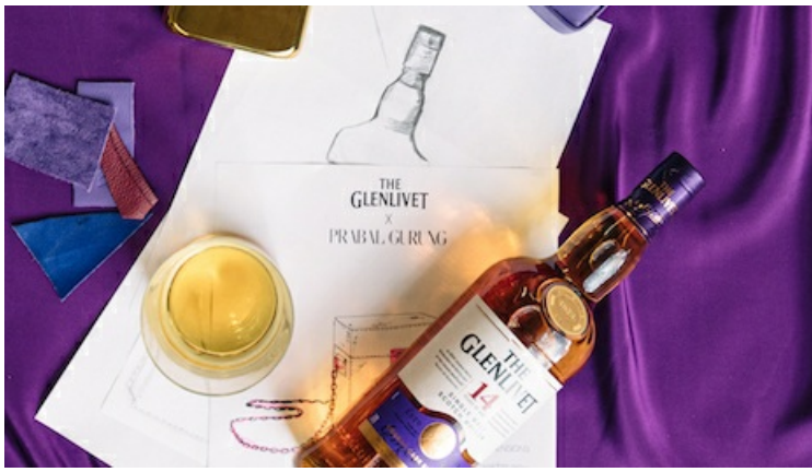
The Glenlivet is collaborating with Prabal Gurung.

Companies also collaborated with celebrities and influencers to gain attention. For instance, Balmain tapped Kylie Jenner for a runway show beauty partnership, while Lancme launched a makeup collection designed by Chiara Ferragni.