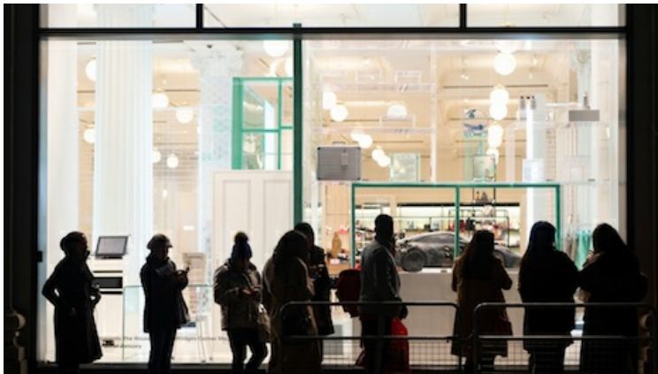
Shoppers lined up outside of Selfridges before dawn ahead of its Boxing Day sale.