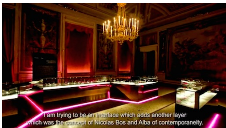
Exhibit room with display cases showcasing Van Cleef & Arpels jewelry at Milan's Palazzo Reale.

Van Cleef is part of Richemont, also owner of French jeweler Cartier.