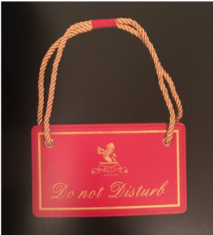
Do Not Disturb doorsign from The Ritz Hotel in London