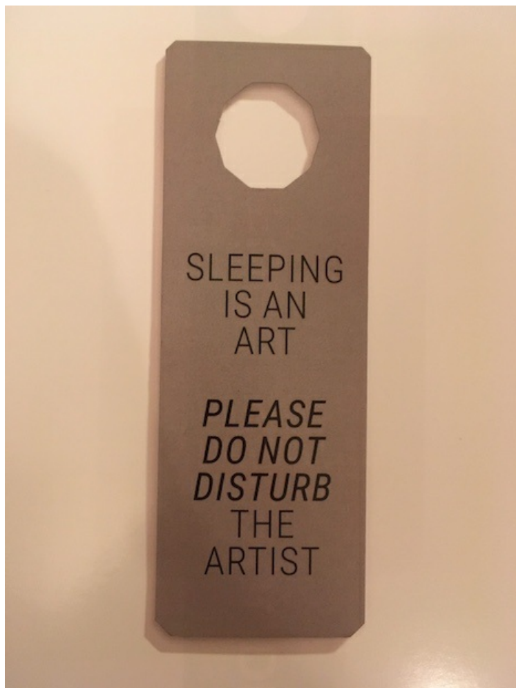
Do Not Disturb from F**K Art Let's Dance

However, I have had the book sold at Dover Street Market London and Los Angeles as well as online, The Laslett Hotel in Notting Hill, Noah NYC, and it is now also available in London at Kiosk from February.