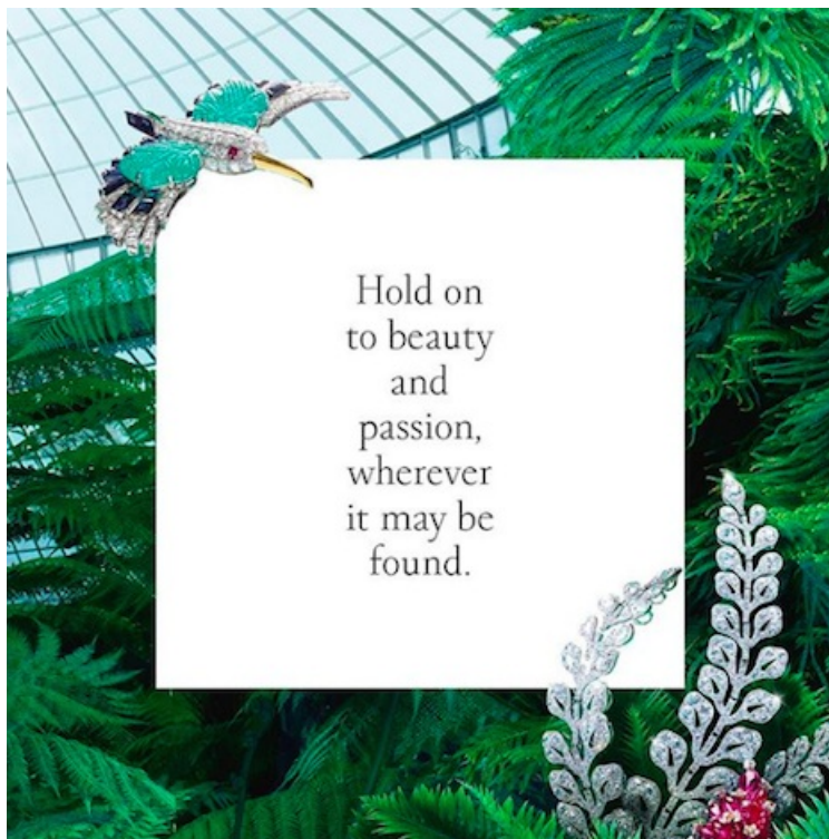
Cartier brooches and pins that reflect a real bird and ferns in a greenhouse setting.

Another message was posted three days ago.