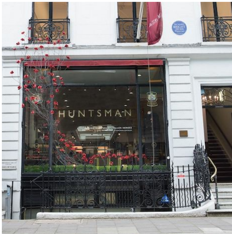
The Huntsman shop at 11 Savile Row in London.

The masks are non-refundable and cannot be returned due to obvious health and hygiene reasons.