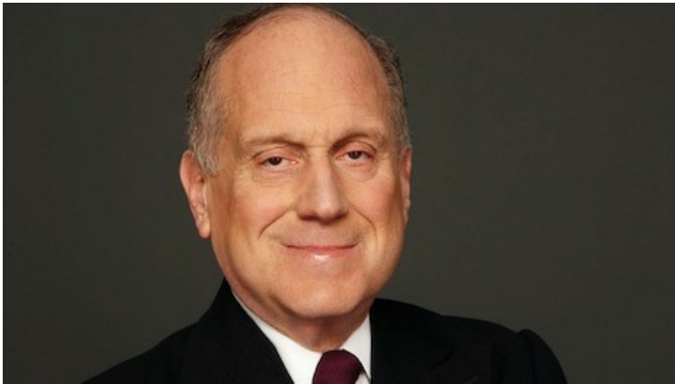
Ronald S. Lauder