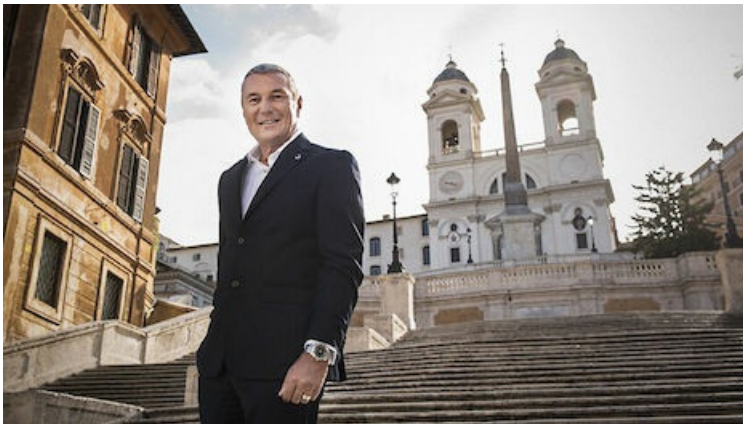
Bulgari CEO Jean-Christophe Babin

Founded in 2001, the LVMH-owned brand's hospitality division claims to be the only Italian luxury hotel collection with a global footprint. It also is the largest hotel group branded by a luxury goods brand, albeit even crystal maker Baccarat is on a similar journey.