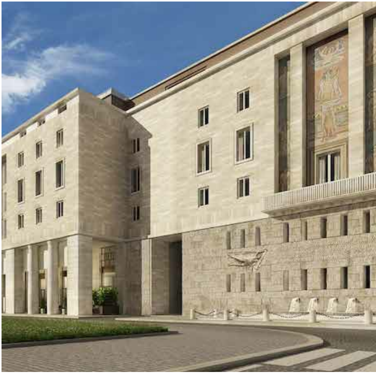
The building that will house the Bulgari Hotel Roma in 2022.