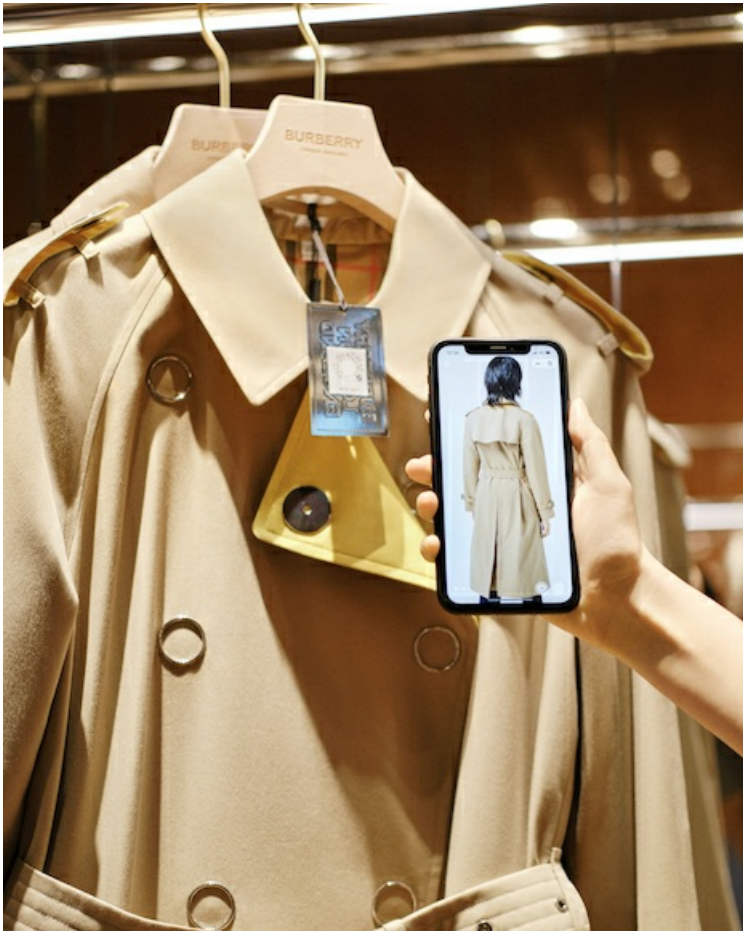
Scanning QR code on Burberry's classic trench coat in the Shenzhen, China social retail store.

Part of that customized digital companion lets shoppers, whether in-store or online, also experience store tours, products and experiences, along with one-to-one client conversations, in-store appointments, events and table reservations in the store caf, Thomas's Cafe.