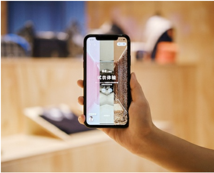
Burberry WeChat mini program in Shenzhen, China social retail store.

"The store is made up of a series of spaces for customers to explore," Burberry said. "Each has its own concept and personality and offers a unique interactive experience."