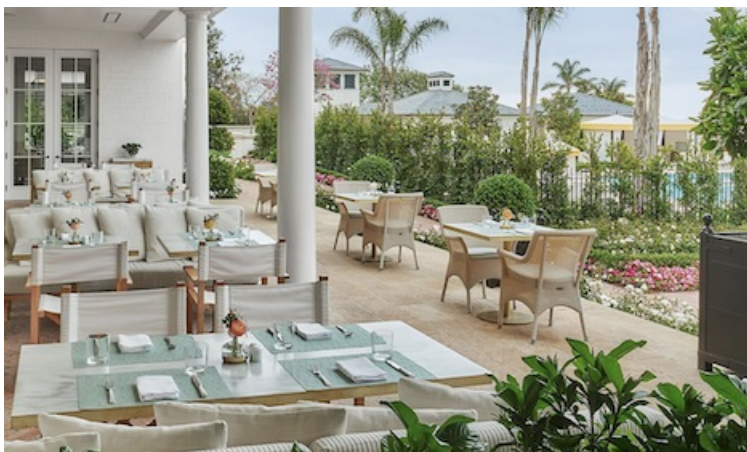
Rosewood Miramar's outdoor dining options.

"At Gurney's Newport, couples have been requesting more flexible menus and themed dinners, so our team has been customizing and creating ideas that are more appealing for smaller groups such as mini barbeques and clambakes."