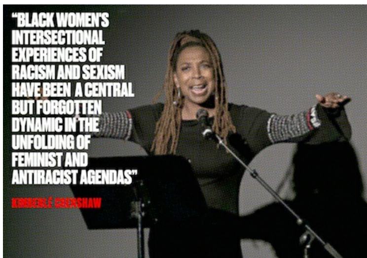
Kimberlé Crenshaw, cofounder and executive director of the African American Policy Forum, is guest editor of the latest edition of Chime Zine, an endeavor from Gucci's Chime for Change.