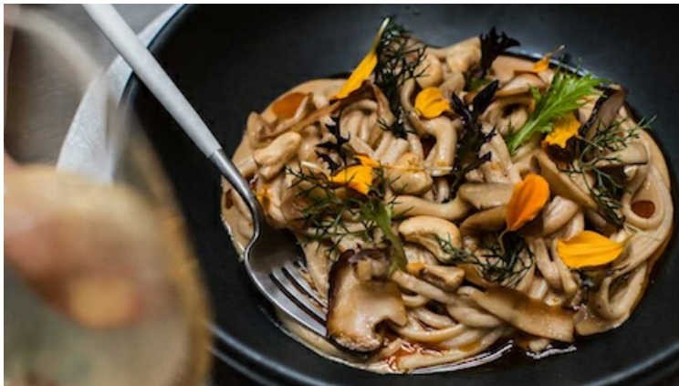
Ovolo Hotels' Alibi Bar & Kitchen in Sydney has a vegan menu.