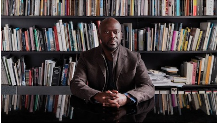
Sir David Adjaye.

"Together with the limited edition SUVs that come with these units, we've created a truly unique signature that blends our two disciplines," Mr. Adjaye said.