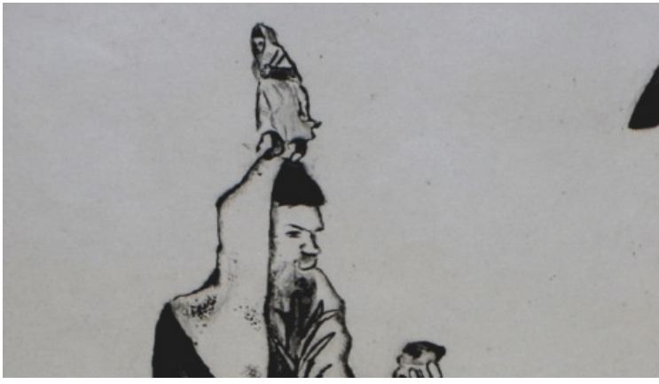
The Rabbi from My Life by Marc Chagall is being offered by Gilden's Art Gallery as part of the Cologne Fine Art & Design Fair.