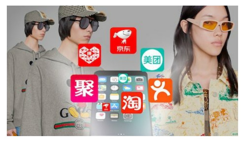
With Chinese consumer growth booming, more luxury brands are investigating China's social commerce platforms. But what are the differences between them.