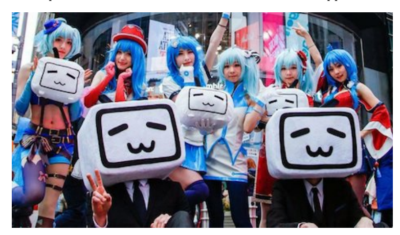
China's fast-growing Bilibili video platform needs a commercialization angle for more brand buy-in.

Douyin, or China's TikTok, was initially paired with Taobao and JD.com for ecommerce on its livestreaming channel. As of October 2020, however, the social media site has its own ecommerce shop, allowing consumers to make purchases from livestream events within the app.