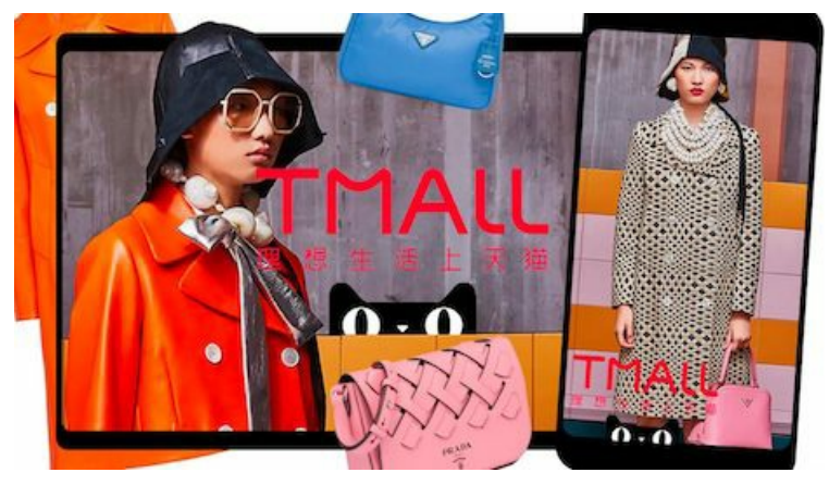
There are several different platforms on China's largest online ecommerce site: Tmall.

Prada, Cartier and Bulgari have all recently joined Tmall, a site that has already hosted several luxury brands on its Luxury Pavilion platform such as Burberry, Versace, Valentino, Guerlain and more.