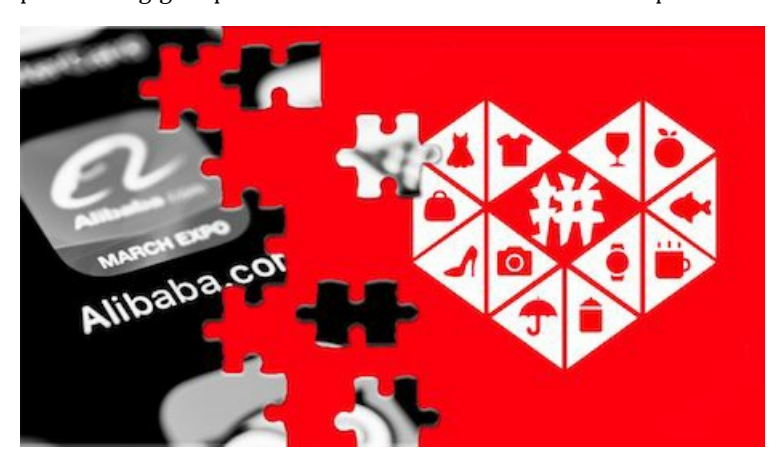
Chinese online retailer Pinduoduo has found amazing success with its "collective buying" shopping model, but now it needs to innovate or suffer the consequences.

Pinduoduo presents a different style of ecommerce with social buying in which consumers can be part of purchasing groups that lower the cost of an item. The platform is accessible through WeChat.