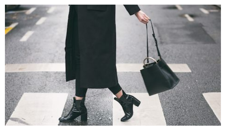
Alibaba Group has launched Luxury Soho, a new platform aimed at young, value-conscious luxury shoppers.

Luxury bricks-and-mortar stores were given the chance to enter into the digital realm by Tmall, as it partners with iStaging to recreate spaces in virtual reality. The program allows brands who sell on the ecommerce site, among whom are a number of luxury labels, to create their own VR stores that allow shoppers to take the in-store shopping experience with them anywhere (see story).