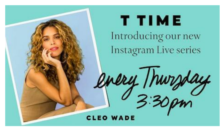
Tiffany T Time is the jeweler's weekly Instagram Live series with guests injecting a tone of optimism as consumers suffer COVID-19 lockdowns worldwide.

U.S. jeweler Tiffany & Co. debuted a new Instagram Live series with an upbeat tone as the U.S. jeweler sought to keep ties warm with its audience under COVID-19 lockdowns worldwide in April of 2020 (see story).