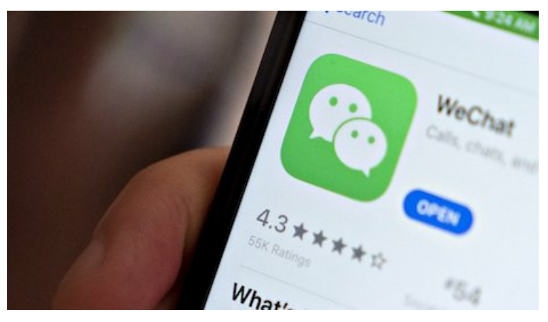
The latest WeChat Luxury Index report from DLG (Digital Luxury Group) and JING digital examines the performance of luxury brands on WeChat and the opportunities that come with livestreaming and social selling within this ecosystem.

with the brand within the social media app and make purchases without exiting the app or being redirected to their Web site.