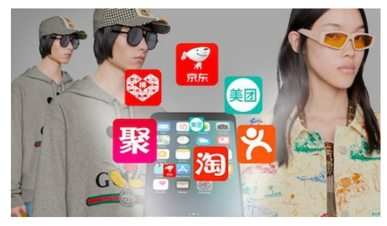
With Chinese consumer growth booming, more luxury brands are investigating China's social commerce platforms. But what are the differences between them.