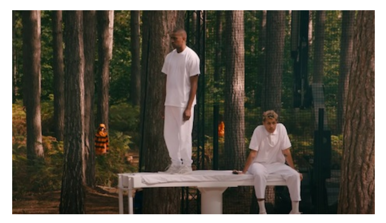
Burberry livestreamed its spring/summer 2021 runway show during LFW in September.

Through livestreaming, social media influencers are able to engage with millions of potential consumers daily. In 2018, Taobao Marketplace generated more than $15.1 billion in gross merchandise volume through livestreaming, according to Alizila, Alibaba's news group.