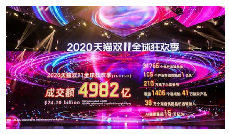
Despite the pandemic, China is still spending. This year's Singles' Day Shopping Festival broke many records and featured roughly 200 luxury brands.

Singles' Day in China has grown to become the largest shopping day in the world. The annual shopping event in 2019 surpassed the four-day shopping week from Black Friday to Cyber Monday by nearly $40 billion.