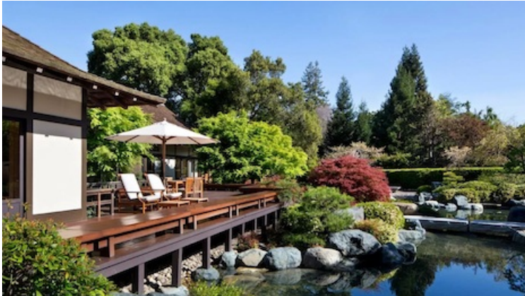
Single-family home in Atherton, CA on the market for $32.5 million.