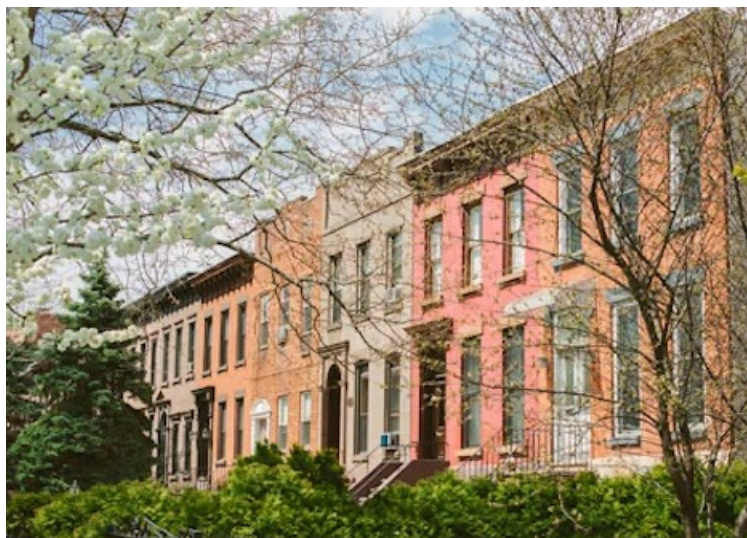
Carroll Gardens zip codes placed Brooklyn among the 100 most expensive for the second year in a row.

Red Hook and Carroll Gardens zip codes placed Brooklyn among the 100 most expensive for the second year in a row.