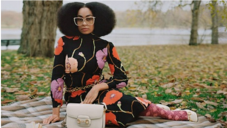
Singer-songwriter Celeste in the Winter in the Park campaign.