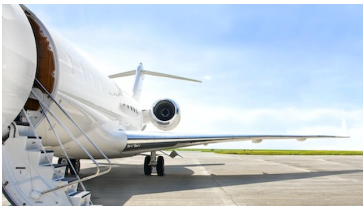
Magellan Jets provides private aviation services to affluent guests.