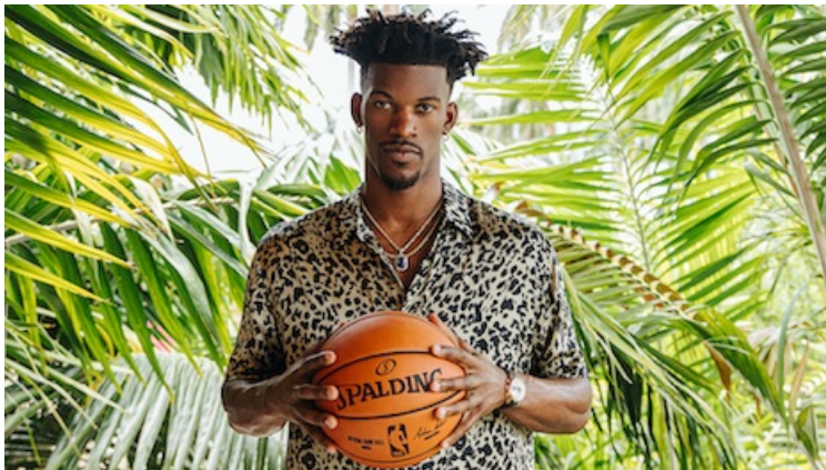
Professional basketball player Jimmy Butler.