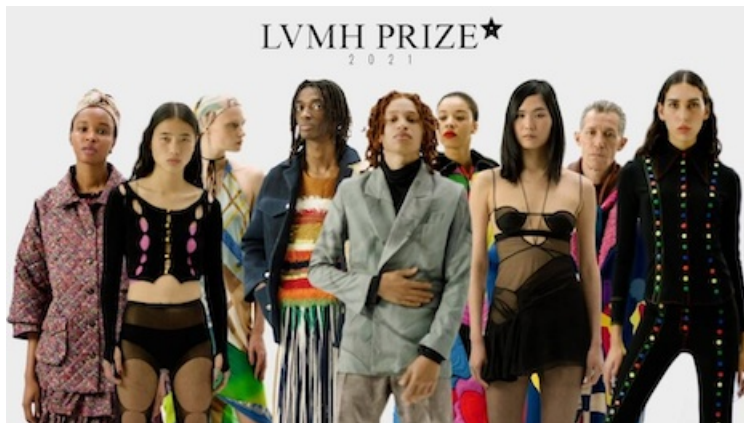
The 2021 LVMH Prize finalists will present their collections on Sept. 7.