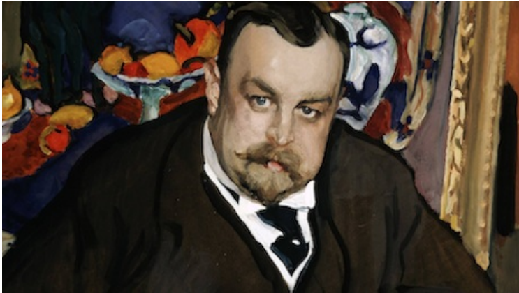
"Portrait of the collector of modern Russian and French painting Ivan Abramovich Morozov," Valentin Serov, 1910.