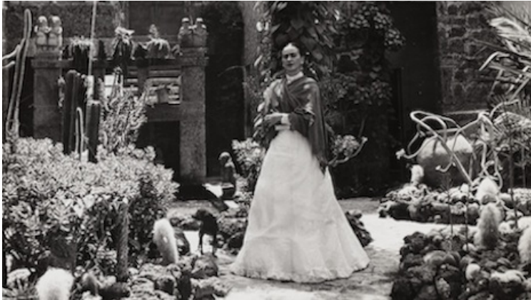
Frida Kahlo In Her Garden Of Casa Azul, Mexico