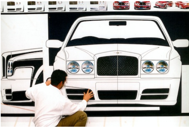
Modern day designers rendering images of Bentley models.

Today, measuring arms and scanning equipment enable quicker assessment of three-dimensional models, and provide data as numeric documents or cloud data uploaded directly within the design studio for instant reference.