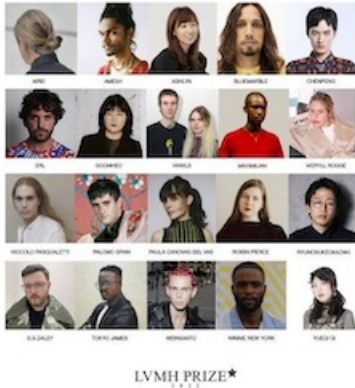
The LVMH Prize 2022 semifinalists.