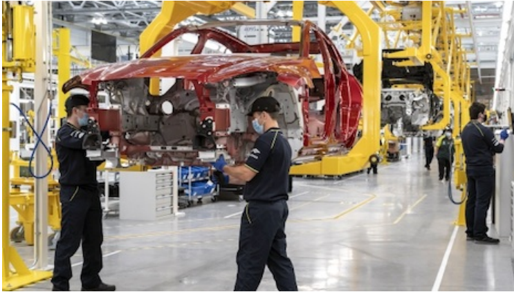
Aston Martin is hiring more technicians to support the production of the DBX707.