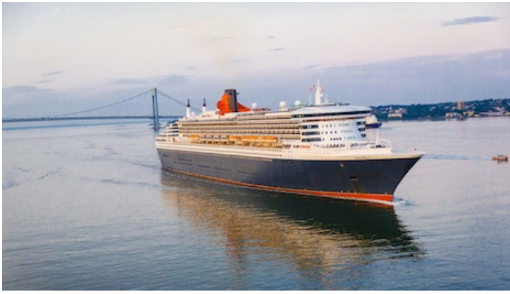
The Queen Mary 2 is the lead ship in the Cunard portfolio, which also includes the Queen Victoria and Queen Elizabeth.

The American actress, comedian, television pioneer, producer and author was arguably one of the most adored entertainers of the 20th and 21st centuries.