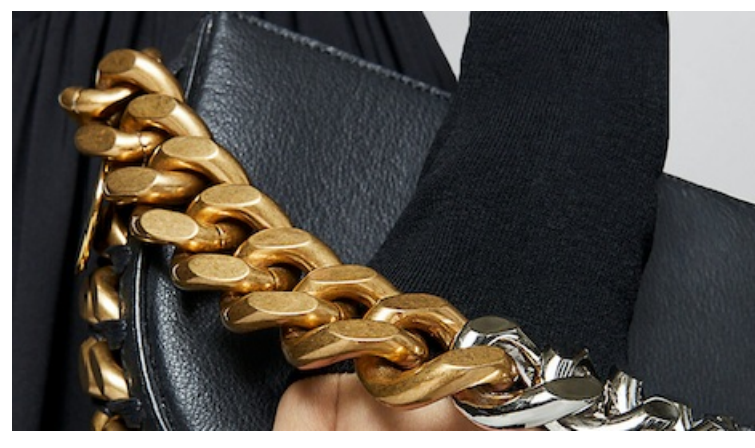
The bag is made of entirely vegan materials. Image credit: Stella McCartney