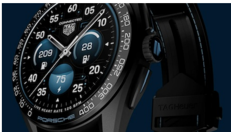
The Tag Heuer Connected Calibre E4 Porsche Edition. Image credit: Tag Heuer