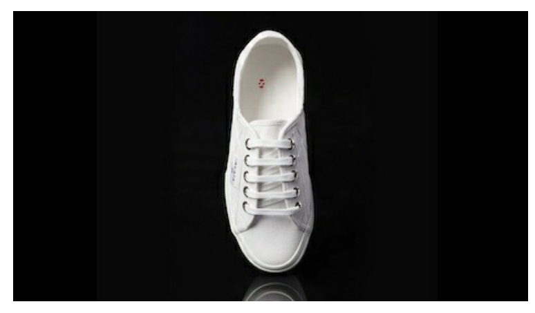
Superga's platforms neaker has been reinterpreted with detailed signatures from the couturier.