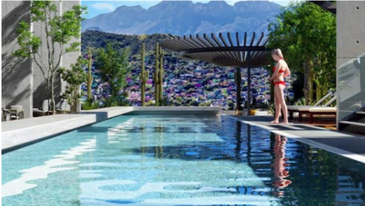
The pool at Galeria Plaza Monterey.