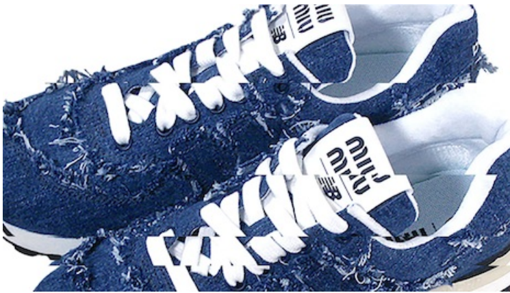
Miu Miu renders the classic New Balance 574 in a number of new colors.