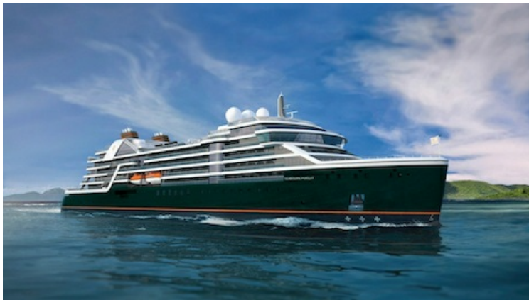
Seabourn's two new expedition ships will take travelers to remote locales north and south.