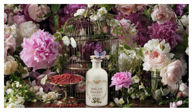
The drop marks a first for both the company and the global fragrance market.