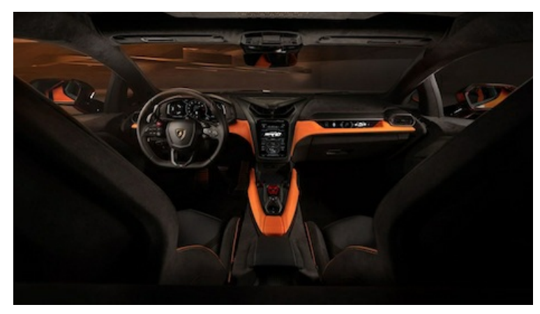
The Revuelto's interior cockpit is led by the brand's "Feel Like a Pilot" design concept.

Externally, the Revuelto arrives with an all-new aerodynamic design, combining classic Lamborghini proportions and sculpted lines. Led by the brand's "Feel Like a Pilot" design concept, an interior cockpit makes a captain of the Lamborghini Revuelto's driver.