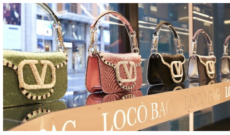
Guests can currently explore the selection on the ground level at Harrods until May 1, 2023.